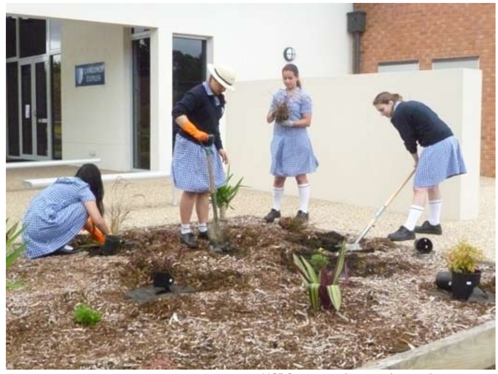
VCE Science students exploring plant growing