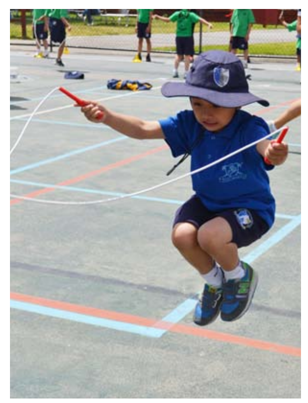
Primary school students enjoying skipping in the "Jump Rope for Heart" program