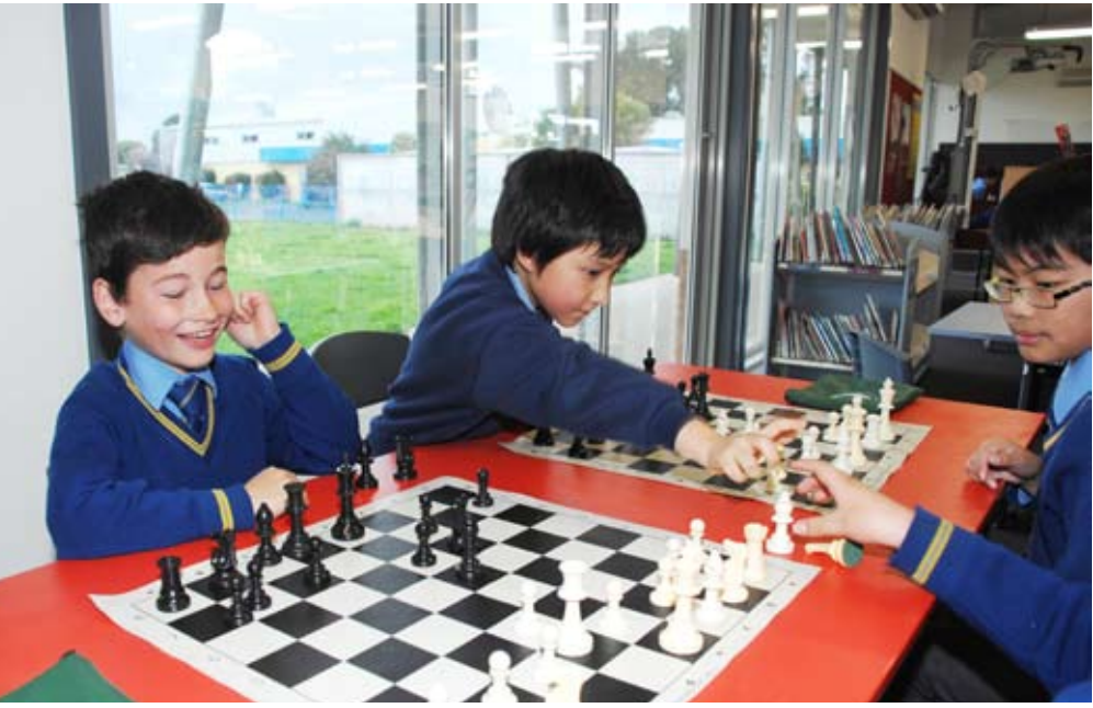
Members of the Primary School Chess Club