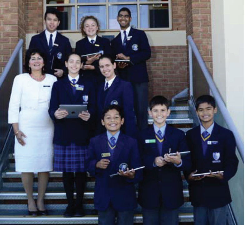
Students utilising technology from the iPad program