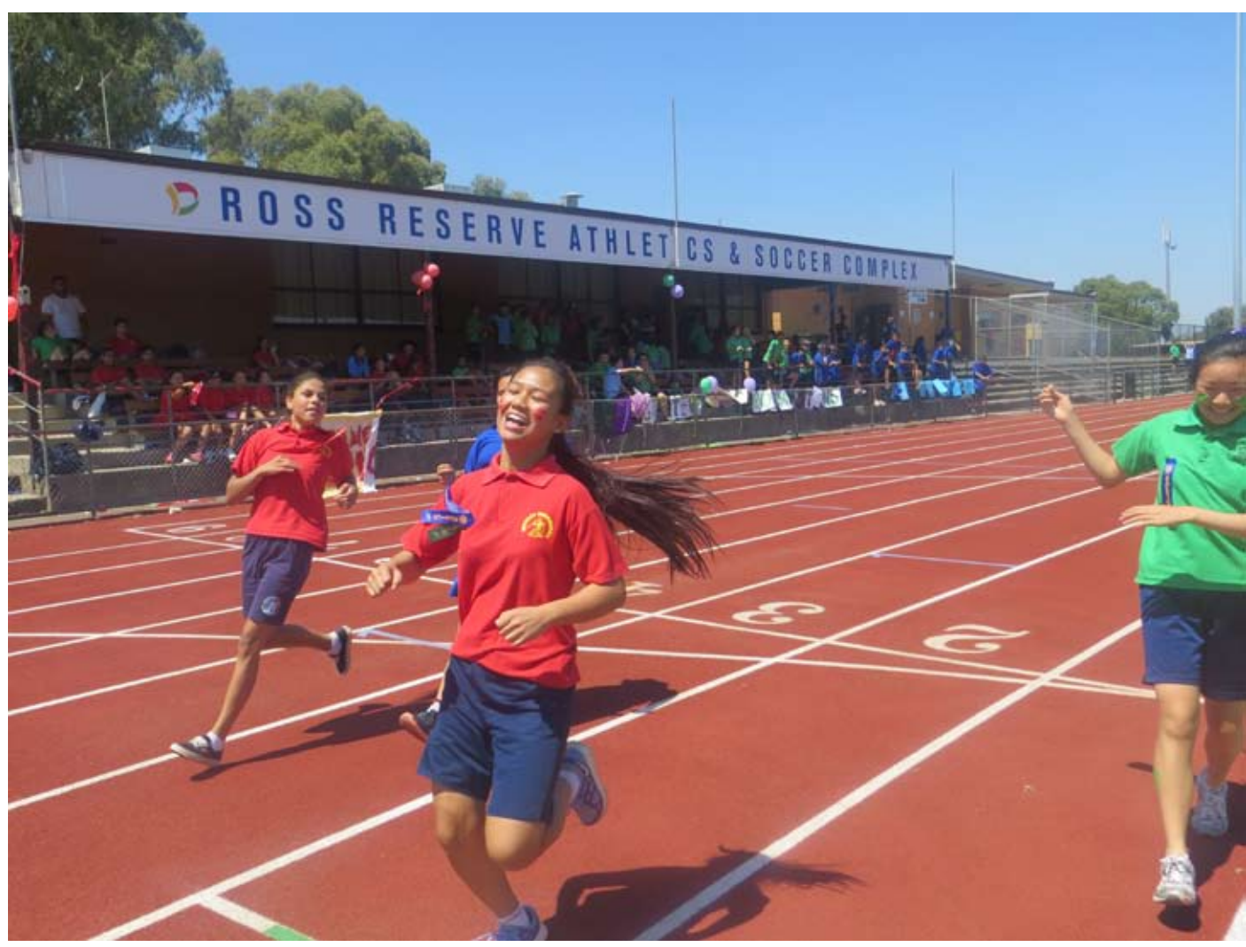
Secondary students House Athletics Carnival