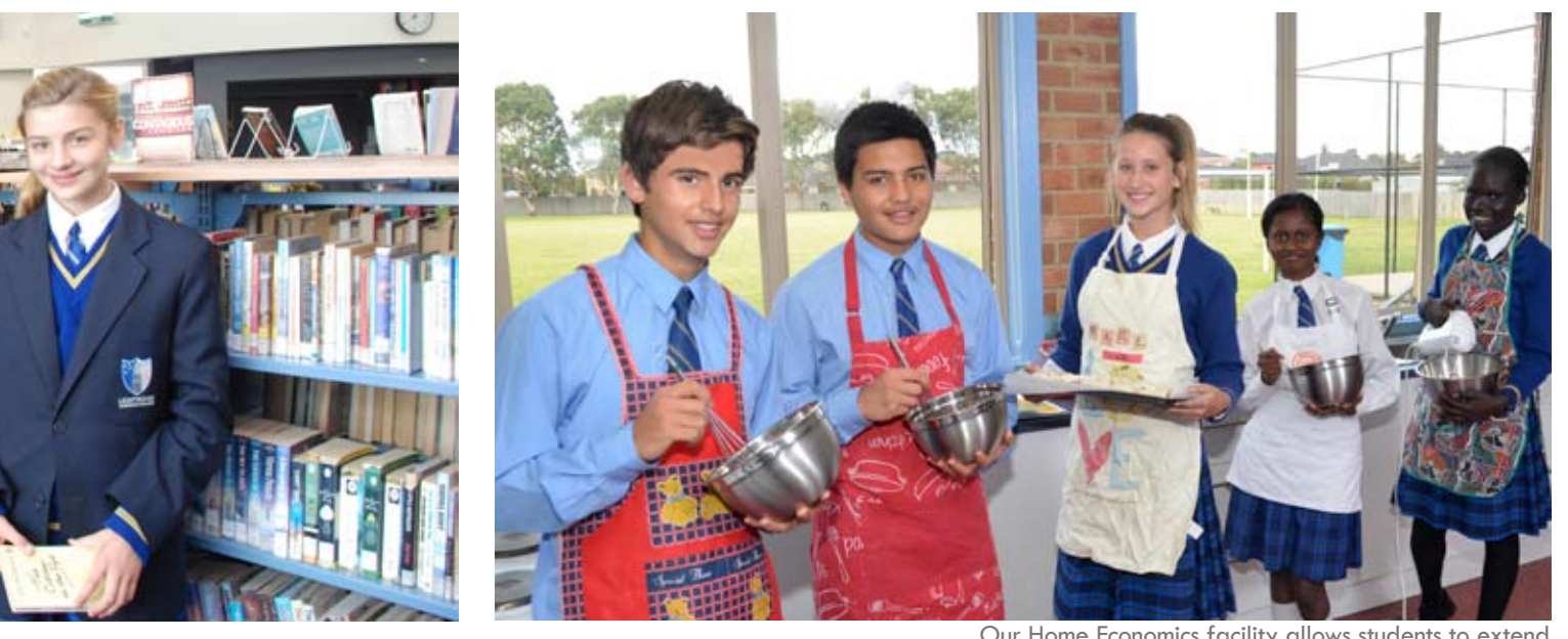
Our Home Economics facility allows students to extend their skills and knowledge about food preparation

Students are taught in a caring Christian environment that encourages them to develop a relationship with God and to place their faith and trust in Him.