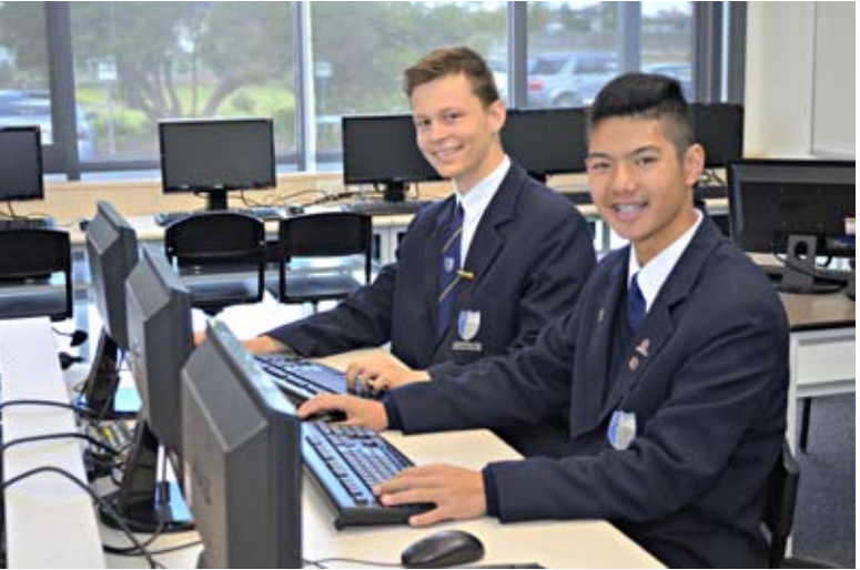
Senior students using computers to support their learning